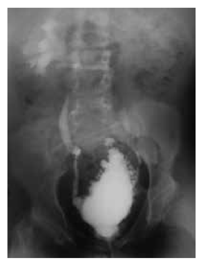
Figure 4. Typical appearance of neuropathic bladder with prominent trabeculations and vesicoureteral reflux

child, tethered cord may be observed, which may affect the neurological status of the child. Each investigation should be compared with the previous one for the early detection of this condition. In genitourinary USG, we look for any hydroureteronephrosis, size, position of the kidneys, renal pelvis, proximal and distal ureters and bladder wall thickness, bladder anomaly in both empty and full bladders. If any hydronephrosis is detected, voiding cystourethrography is indicated for the identification of hydronephrosis with or without VUR (Figure 4). DMSA is preferred for the detection of any renal scarring, which is actually the final target of the follow-up. Risk factors for scarring should be identified to take proper precautions and act proactively (20). The main