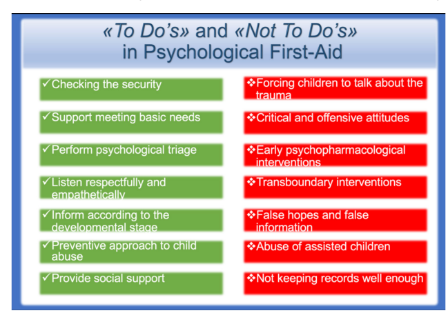
Figure 1. The "Do's and Don'ts" in psychological first aid *Created by the authors based on the literature

Earthquakes introduce many children to the concept of death. The loss of family members can lead to an increase in psychiatric problems, impairment in school and peer functioning, social withdrawal, behavioral problems, and physical symptoms. The important thing is to understand the normal grief reactions of children after loss and to recognize any pathological grief reactions. According to the model introduced by Kübler and Ros, grief goes through five stages: shock and denial, anger, bargaining, depression, and acceptance (34). Young children may find it difficult to understand concepts as abstract as the idea of death. They